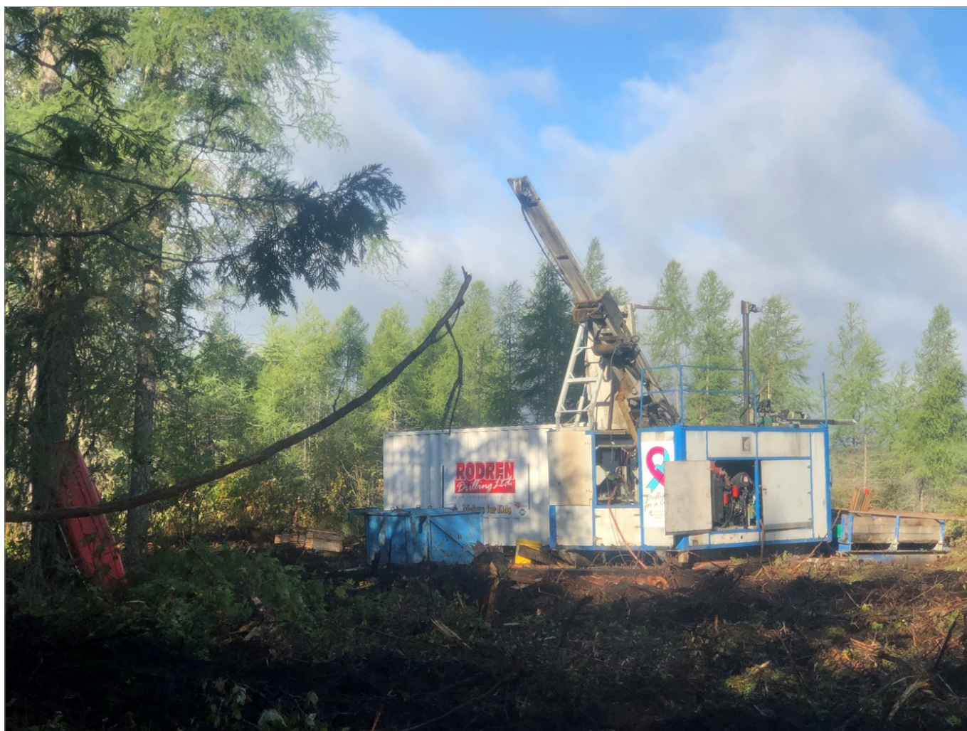
Figure 2 – Shallow Drilling at Talmora

Tombill Mines Confirms Continuance of the F-Zone Extension Over Its Flagship Property, Discovers New High Grade F2-Zone, and Starts Shallow Drilling. In tandem with Tombill's deep F-Zone drill campaign, the Company is also undertaking aggressive surface exploration. A near-surface drill program started some two weeks ago on Tombill Main Group's Talmora target located in the northeast corner of the property in areas surrounding a past producing Talmora gold mine. To date, two holes have been completed in the 300 to 450 metre range, and a third hole is currently in progress. The target is a broad zone believed to have potential for disseminated mineralization.