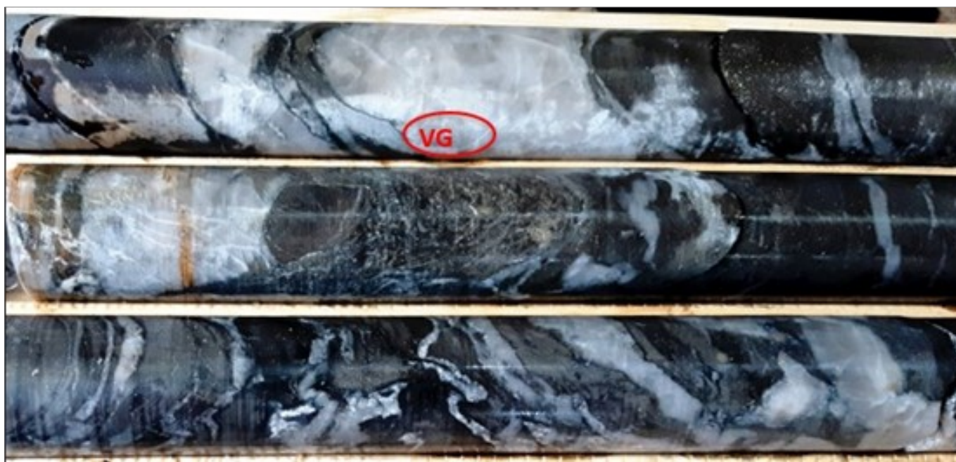
Figure 2 – F-Zone Mineralization in Hole TB21-005A at Around 1099 m. Sample #445087 Within Photo Returned 50.6 gpt Au Over 1.0 m From 1095.0 To 1096.0 m.

More than 7 km of core have been drilled to date on the Phase One Program. The Program is ongoing with two drills from Rodren Drilling.