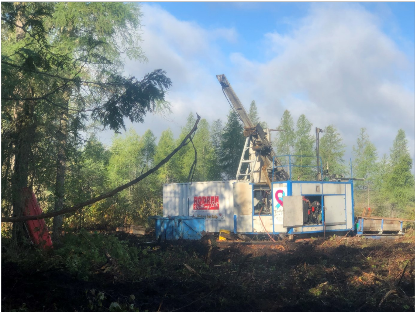
Figure 2 – Shallow Drilling at Talmora

Tombill Mines Confirms Continuance of the F-Zone Extension Over Its Flagship Property, Discovers New High Grade F2-Zone, and Starts Shallow Drilling. In tandem with Tombill's deep F-Zone drill campaign, the Company is also undertaking aggressive surface exploration. A near-surface drill program started some two weeks ago on Tombill Main Group's Talmora target located in the northeast corner of the property in areas surrounding a past producing Talmora gold mine. To date, two holes have been completed in the 300 to 450 metre range, and a third hole is currently in progress. The target is a broad zone believed to have potential for disseminated mineralization.